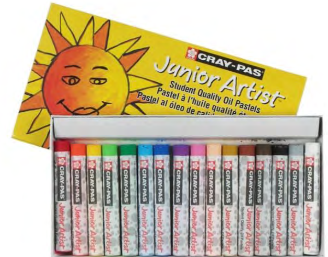
ART-201 16 ct.