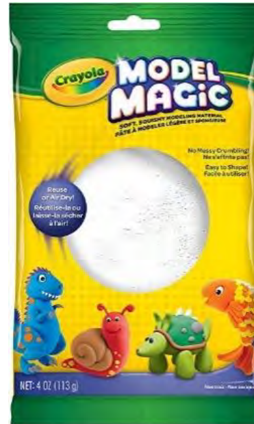
ART-320 4 oz. White