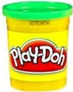
ART-310 1 count, 3 oz. Assorted