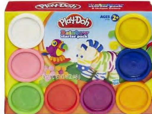
ART-318 8 count, 2 oz. Rainbow Starter Pack