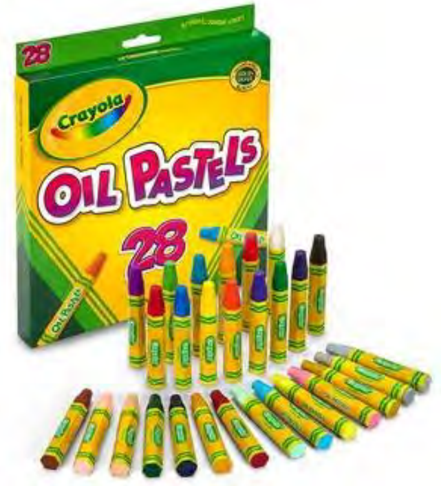
ART-210 28 count