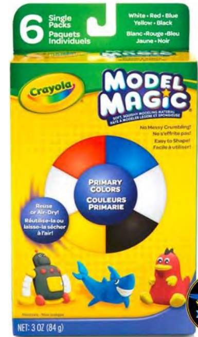
ART-322 6 ct., .5 oz. Assorted Primary