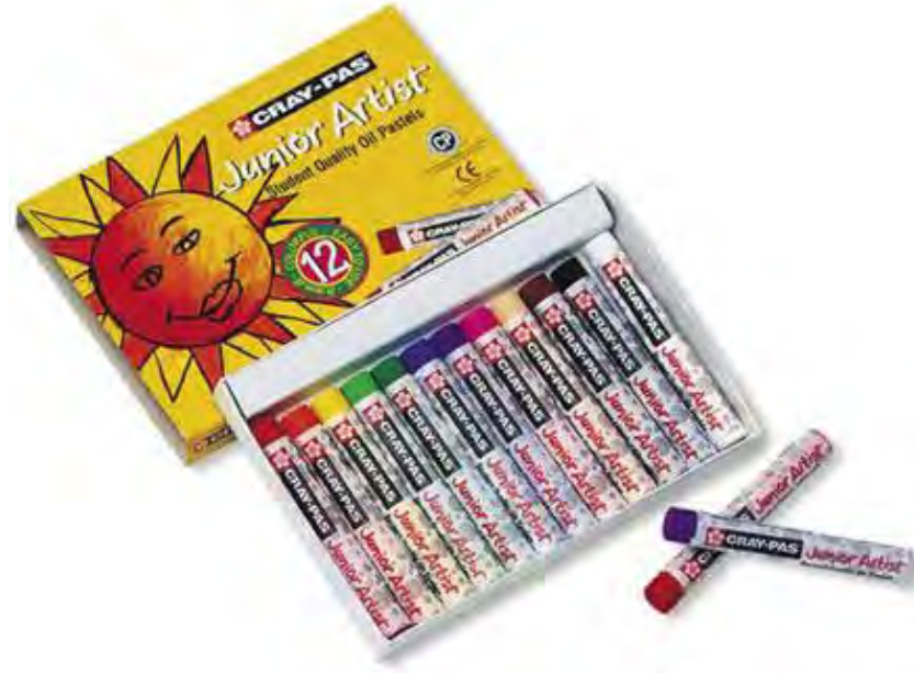
ART-200 12 ct.