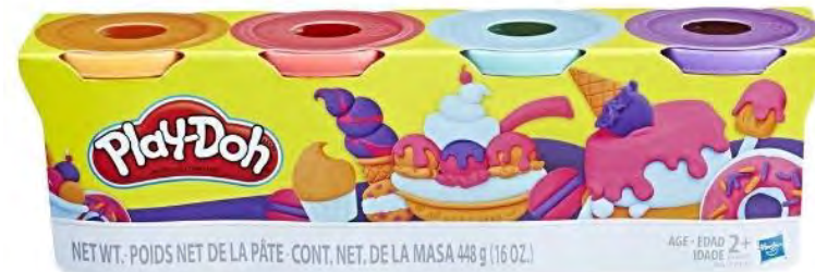
ART-314 4 count, 4 oz. Assorted Colors