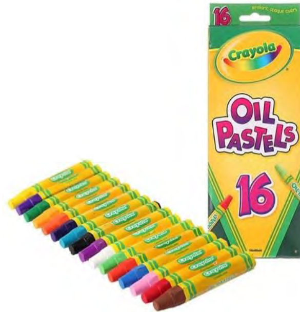
ART-100 16 count